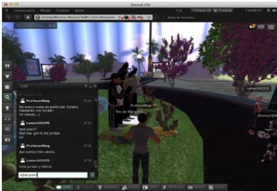
Figure 3. Mariachi Band in Mexico

When communicating with native Spanish speakers in Second Life, participants often developed an interest in the culture of the Spanish-speaking countries they were visiting in the virtual world. Though they had the specific goal of completing an assignment in Second Life, all participants extended their communication beyond specific curricular topics to explore the context and get to know their interlocutors (See Figure 3).