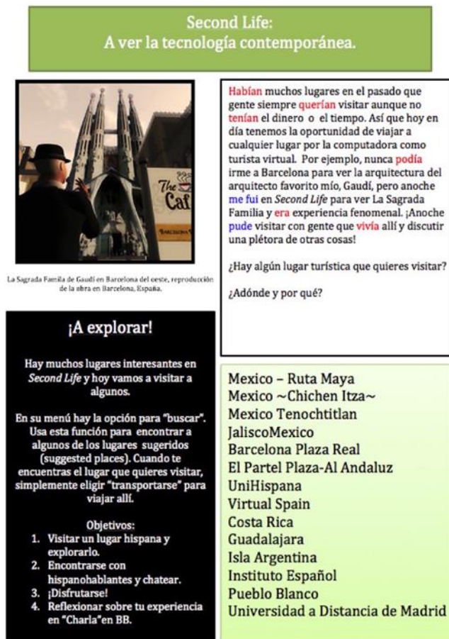
Figure 2. Contextualized Orientation Activity